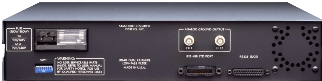
SR640 rear panel